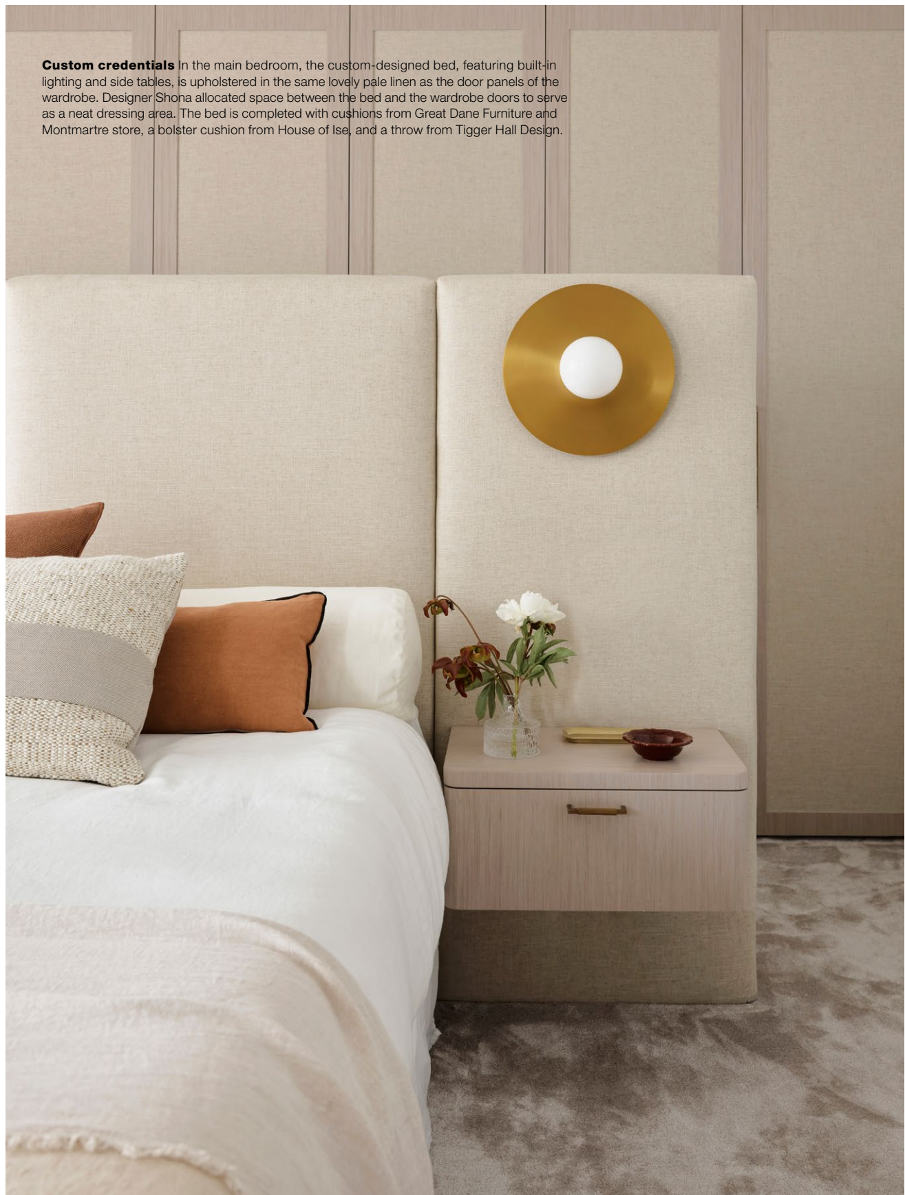
Custom credentials In the main bedroom, the custom-designed bed, featuring built-in lighting and side tables, is upholstered in the same lovely pale linen as the door panels of the wardrobe. Designer Shona allocated space between the bed and the wardrobe doors to serve as a neat dressing area. The bed is completed with cushions from Great Dane Furniture and Montmartre store, a bolster cushion from House of Ise, and a throw from Tigger Hall Design.